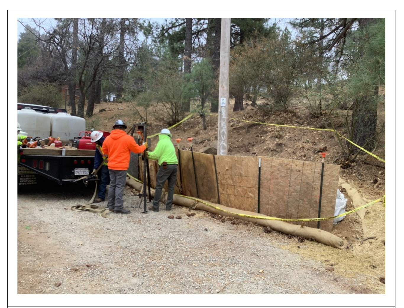
Photo 6: A crew was observed maintaining plywood erosion control BMPs at Pole P40430 (C 440) to contain spoils within the work area in accordance with APM HYD-09, the ECP, and the SWPPP (MM HYD-1, MM BIO-7).