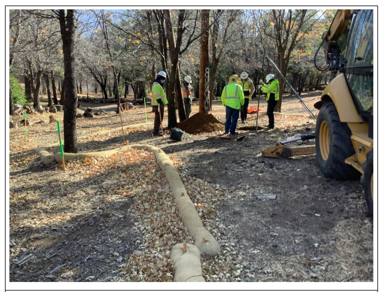
Photo 1: A crew was observed digging a direct bury pole hole at Pole P40211 (C 440) within clearly delineated work limits in accordance with MM BIO-1.