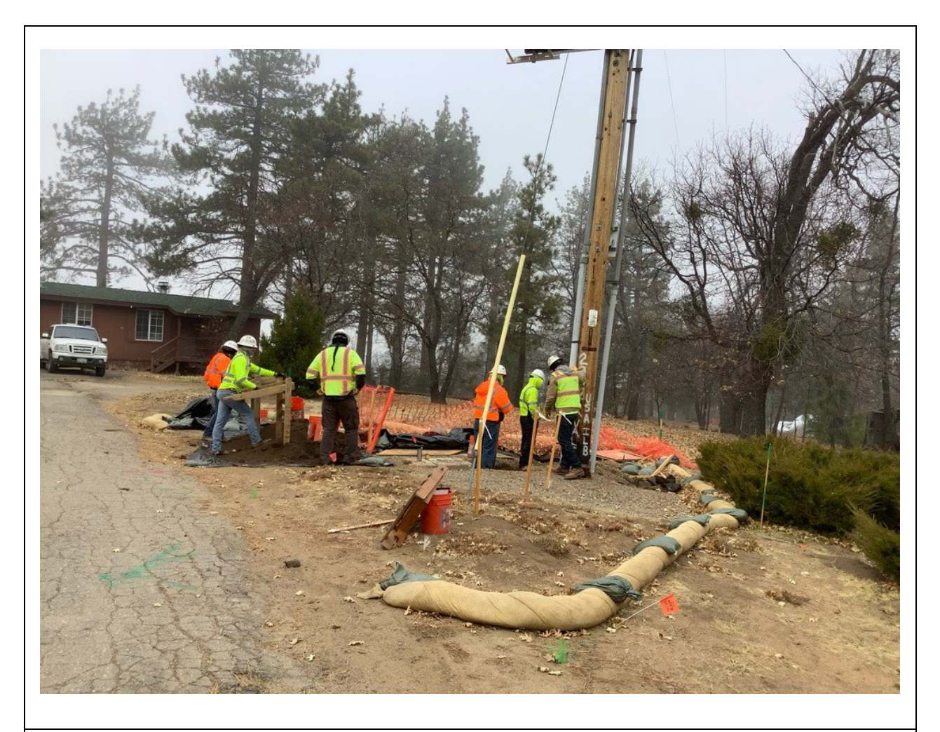
Photo 2: Cultural and Archaeological Monitors were observed monitoring trench excavation and screening spoils for resources along C 440 in accordance with the HPMP, APM CUL-04, MM CUL-1, and MM CUL-3.