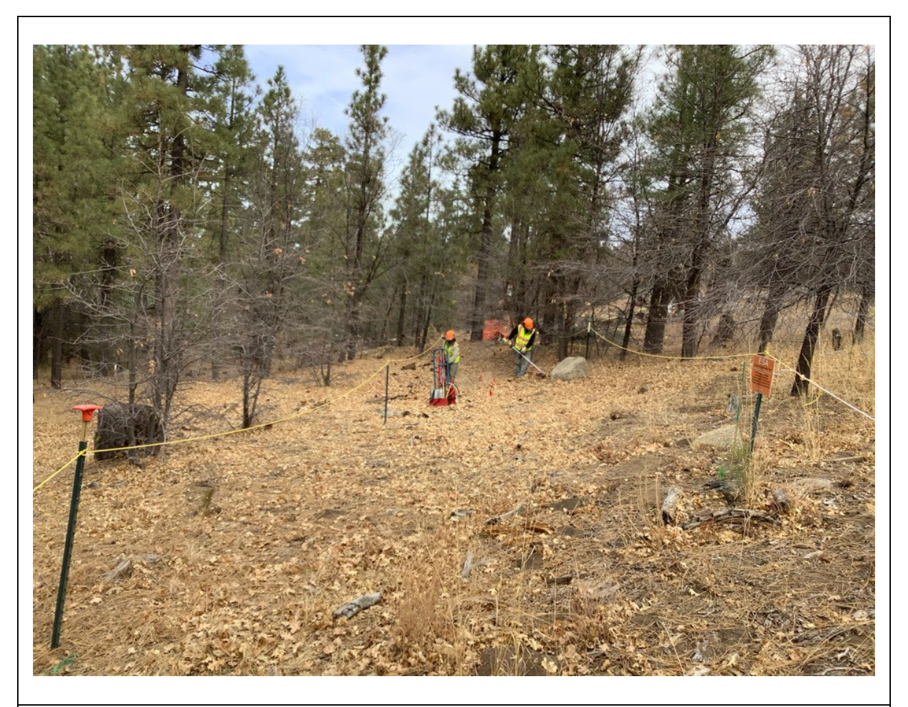
Photo 3: Crews were observed adhering to clearly delineated ESAs along C 440 in accordance with the HPMP and APM CUL-03.