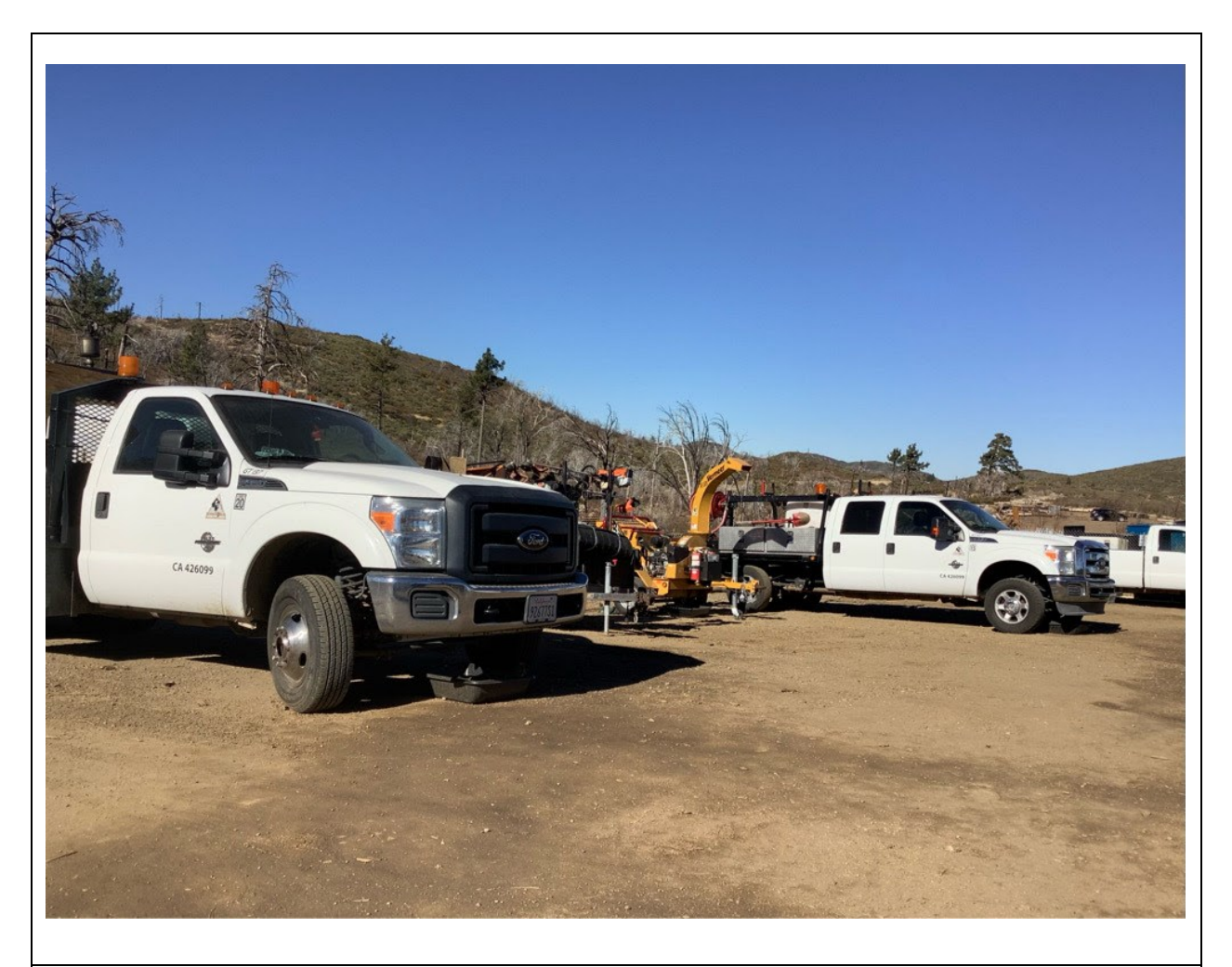
Photo 5: Drip pans were observed under staged vehicles and equipment at Shrine Camp Staging Yard (C 440) to prevent leaks or spills from being discharged onto the ground in accordance with the SRNP and MM PHS-2.